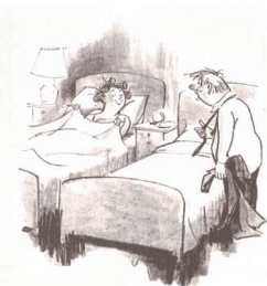
"All right, so you joined Al-Anon! Do you have to be so damed sweet about everything?"

An excerpt from "A Rabbit Walks into a Bar: Best Jokes & Cartoons from AA Grapevine"